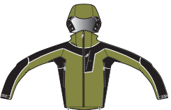
2030U5 CANADIAN JADE