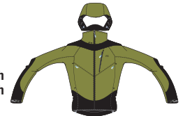
20130U5 CANADIAN JADE